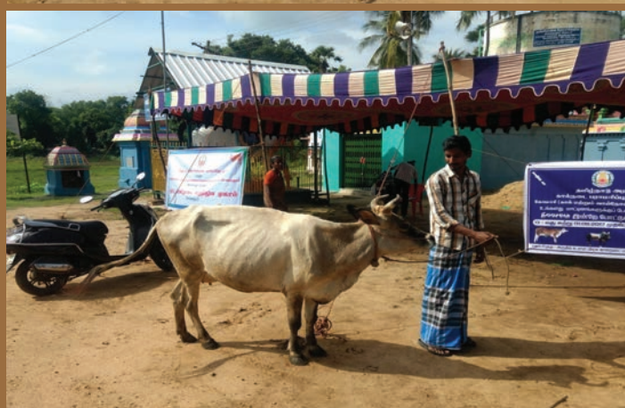
Animal Welfare Camp 29/11/2016 at Senganur by Senganur Kshetra Upasana Samithi in association with Tamilnadu Govt animal husbandry department...